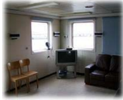
TV Area & Lounge