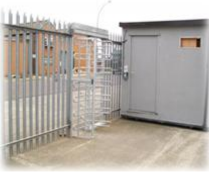
Secure access available