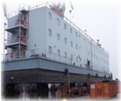
'Hillside' in drydock